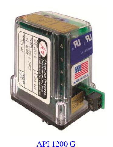
Thermocouple Input Alarm

<u>Solution</u>: Since the customer needed a "failsafe" operation they chose to use an API 1200 G D HT. This allowed the customer to use a module that is not only has "failsafe" relay operation but it has a latching operation that requires someone to manually reset the furnace and verify that the power is operating properly.